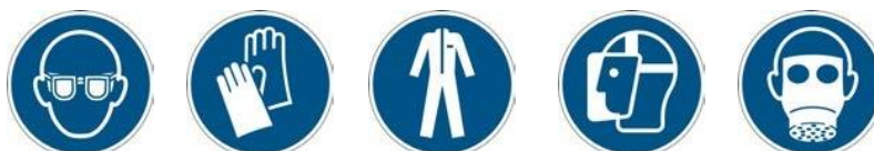
Protective goggles. Gloves. Protective clothing. Face shield. Gas mask with filter.